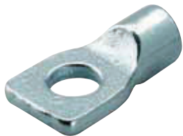
Thread hanger RAH